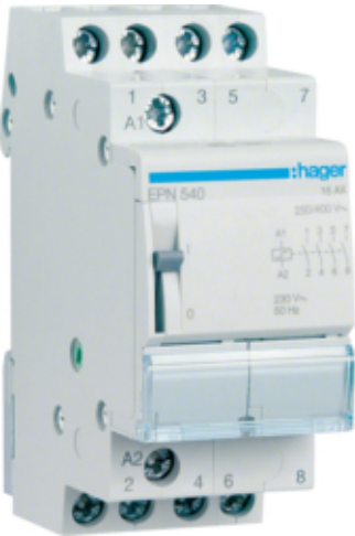
Latching relay 4NO 230V