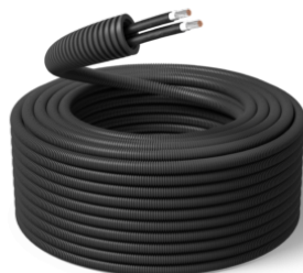
20 mm / H1Z2Z2-K UV 2x6 NN / R100