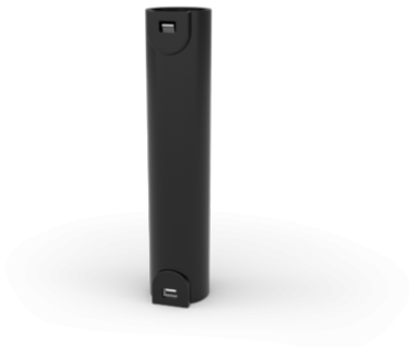
UV coupling with clip 20 mm