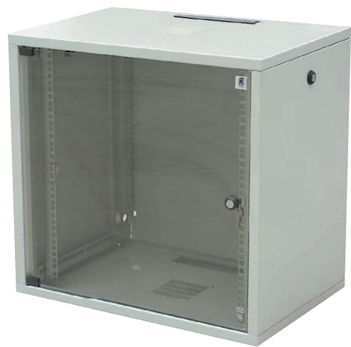
SU cabinet 12 U high with safety glass door