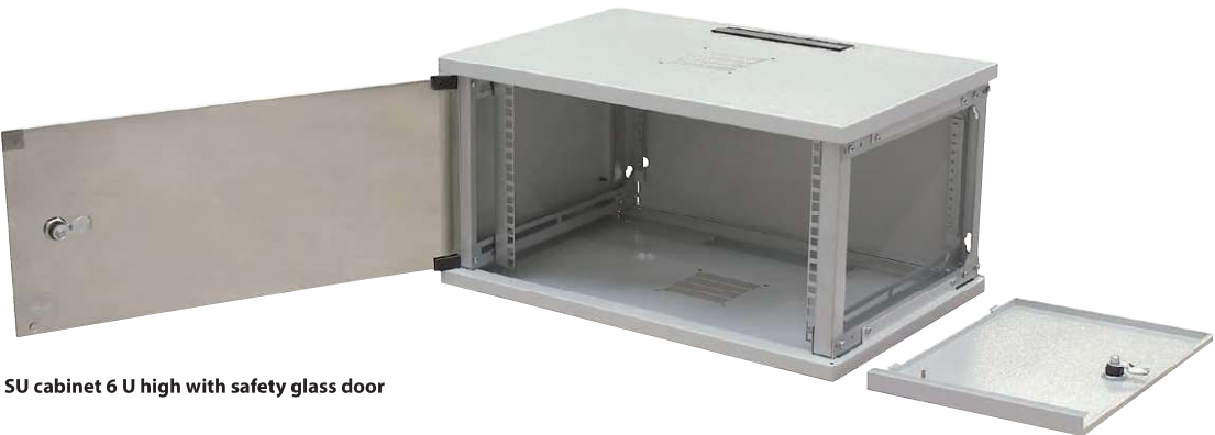
SU cabinet 6 U high with safety glass door

Frame, bottom plate, top plate, door, 2 side panels, rear panel, 2 mounting angles, brush, template for drilling holes in the wall.