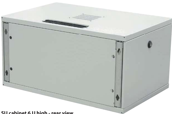
SU cabinet 6 U high - rear view