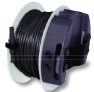
044039 Example figure