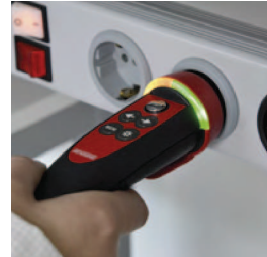
"Commander" test plug 044149