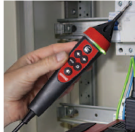
"Commander" probe tip* 044155