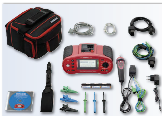
Scope of delivery BENNING IT 130