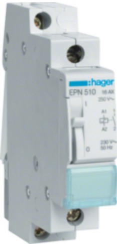
Latching relay 1NO 230V