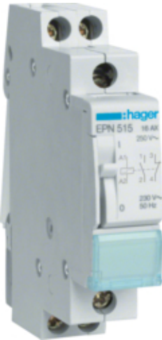
Latching relay 1NC+1NO 230V